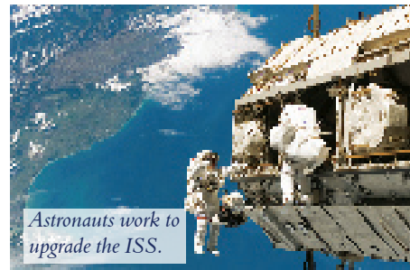
Astronauts work to upgrade the ISS.