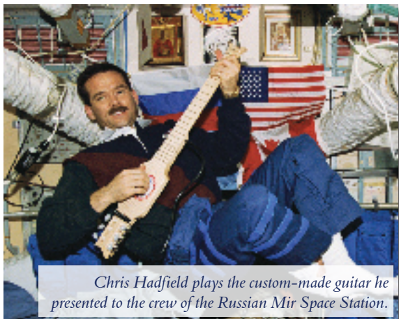
Chris Hadfield plays the custom-made guitar he presented to the crew of the Russian Mir Space Station.

Before BCB, many Pearl Hall students had never experienced a world beyond the four-mile radius of South Houston. Now they realize that their world extends